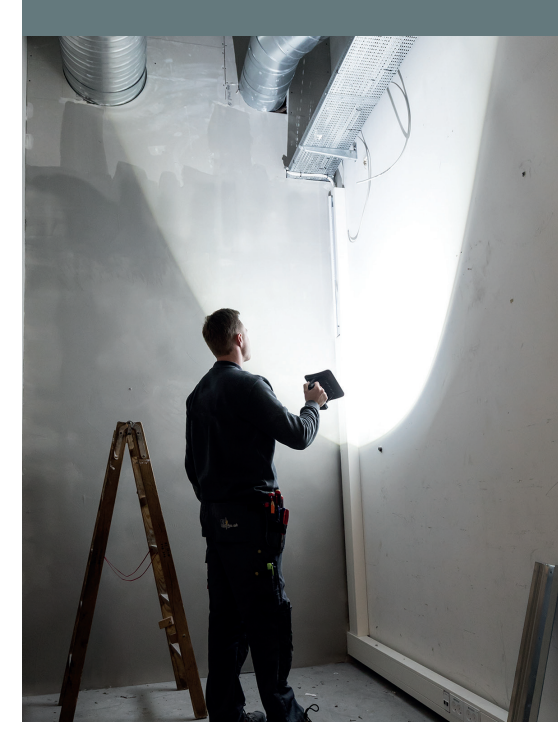
The NOVA R handlamp is remarkably handy and provides powerful illumination up to 2000 lumen. It is ergonomically designed for a good grip on the handle.

SCANGRIP is the story of a remarkable transformation from a local blacksmith to Europe's leading manufacturer of LED work lights. The company designs and develops own products and receives strong recognition worldwide for its innovative product design. Production takes place at own lighting factories in Denmark as well as China. SCANGRIP has also invested in a battery pack factory.