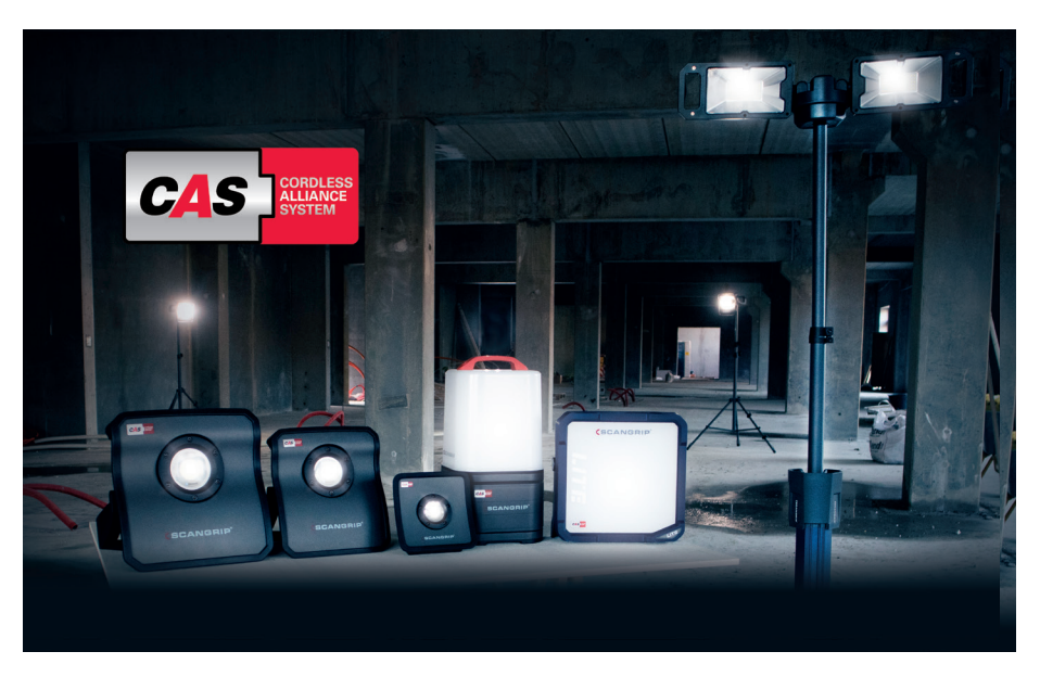
SCANGRIP has entered a partnership with Cordless Alliance System (CAS). This collaboration with METABO/CAS is strengthening SCANGRIP's position even further and fulfill its ambition to be the leader in Europe in lighting solutions with attractive battery packs

If you would like a work light with exchangeable batteries, like the concept from power tools, the NOVA range offers to options: The SCANGRIP POWER SOLUTION system or CAS/ METABO battery system. The SCANGRIP