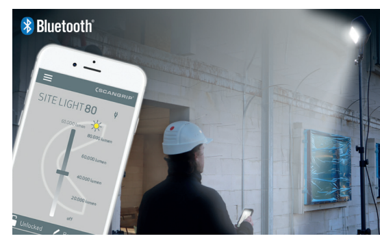
SCANGRIP transforms input from the market into practical lighting solutions. As a result, the built-in BLUETOOTH light control makes it easy to adjust the light output and turn on/off the lights remotely from a mobile phone.

SCANGRIP work lights are available in almost any hardware store in Germany. Check out the full product range at www.scangrip.com/de where you also find contact information on our German sales team.